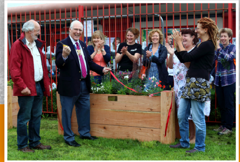
Budding Community Garden Opened by the Deputy Mayor