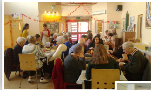
Senior Sunday Lunch FirstBite rustle up an autumn feast