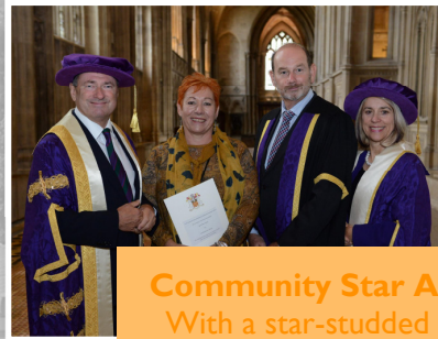
Community Star Award With a star-studded cast!