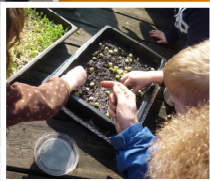
Edible Garden Alive and sprouting!