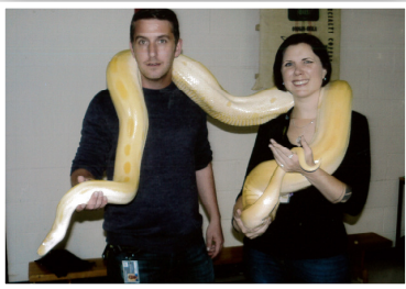
Staff know how to accessorise at Party in the Park